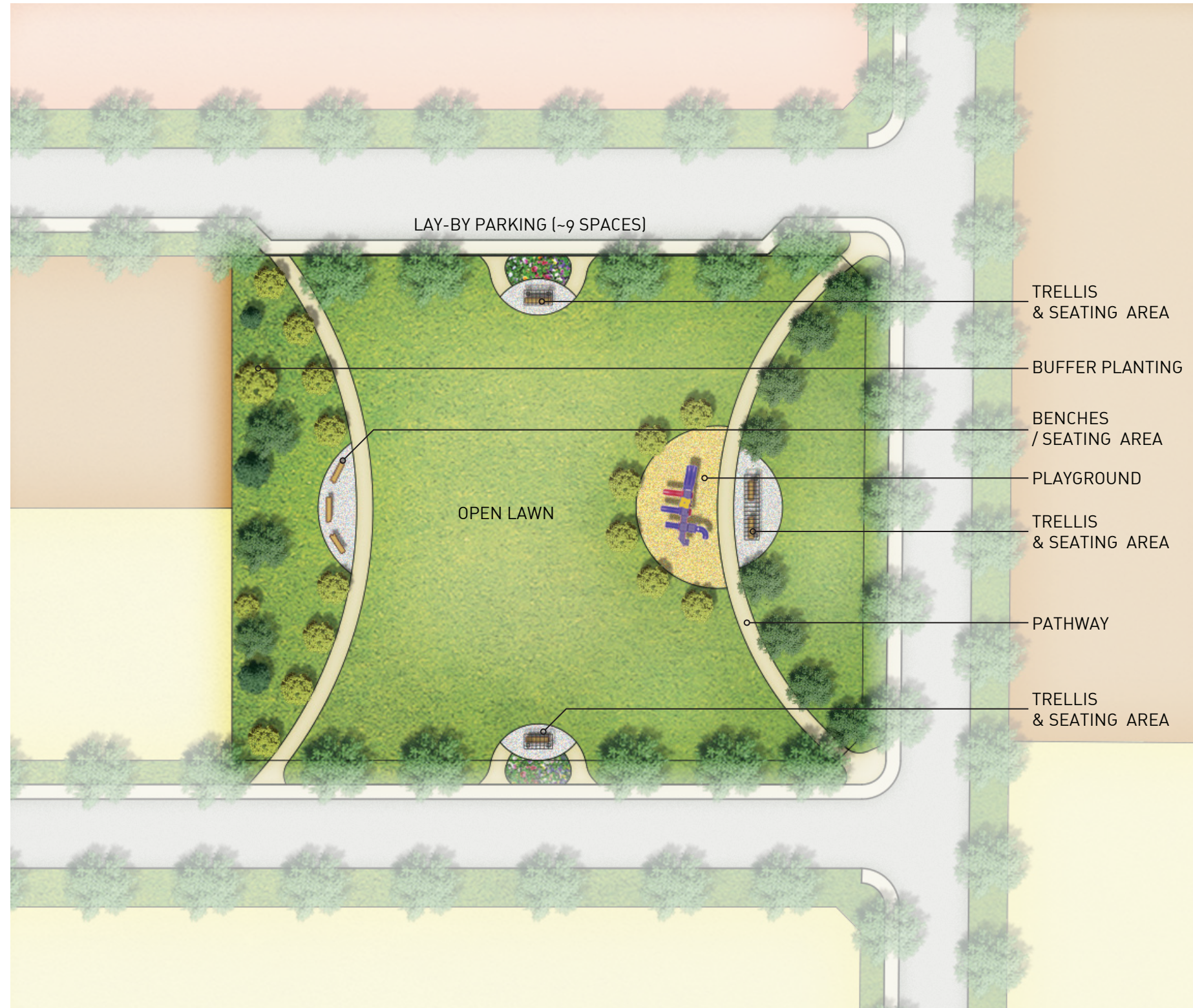
Playground & Seating