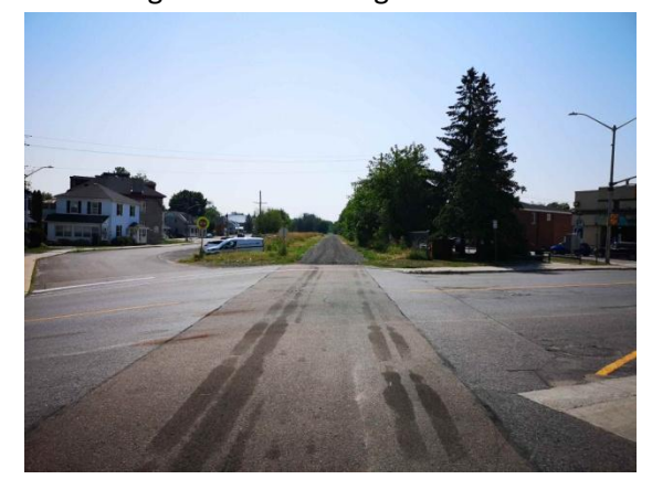
Hopefully the idea will take root and grow into something much bigger over time.