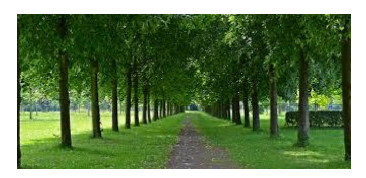
The idea is simple to start. It is the section from Church St. to Bridge St. that is being considered.

A variety of people and groups have galvanized around the idea of a tree lined path along the OVRT. When a comment was made on Facebook recently it was immediately applauded by about 100 people with many offers of help.