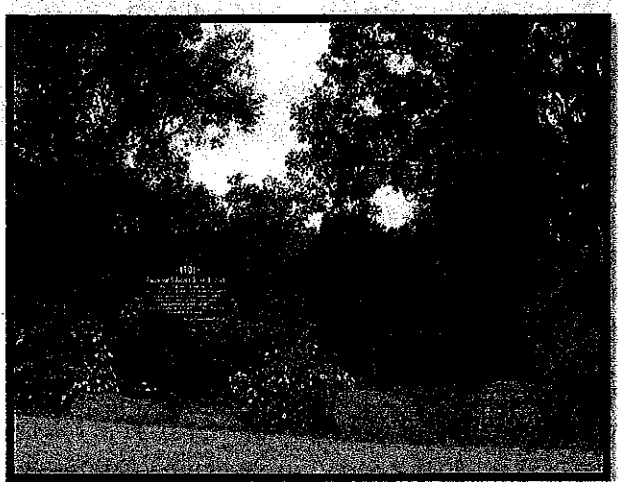
Prepared by the Pakenham Horticultural Society, Beautification Committee - March 2019