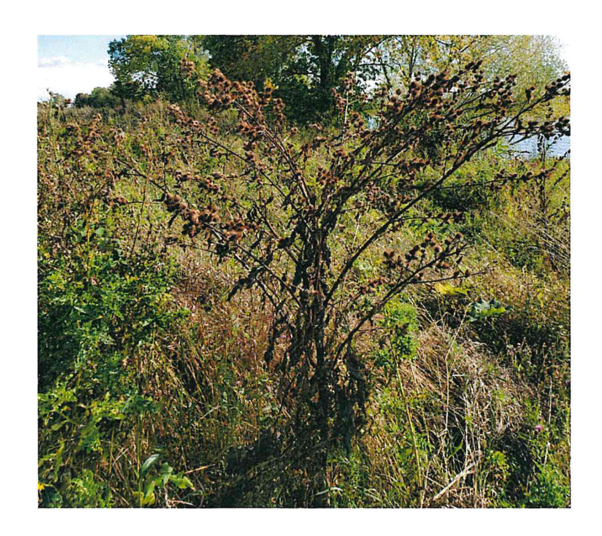
There is some Burdock in the seeded area. This one in particular was adjacent to the path to the dock.