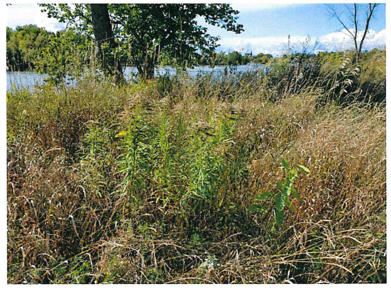
Golden rod and milkweed growing in the seeded area