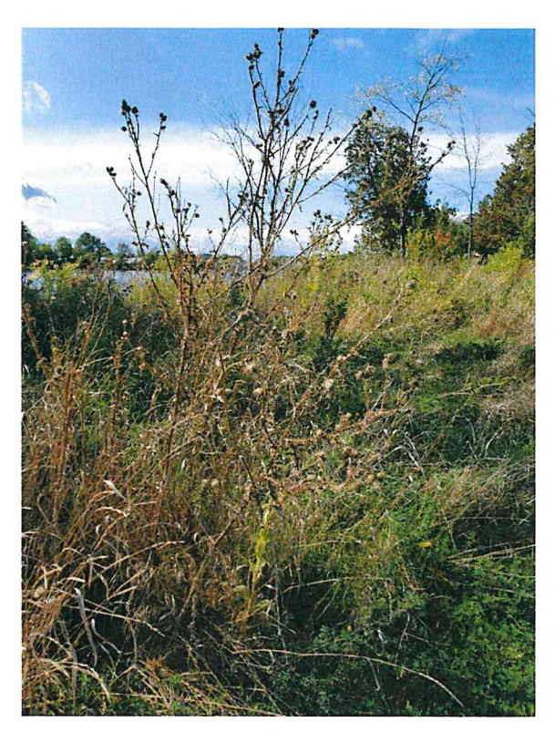
There was lots of this thistle in the seeded area.