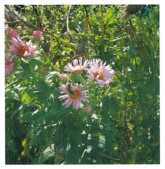
One of the aster sp in the seeded area with a pollinator on it.

The park space zone with seeded buffer area.