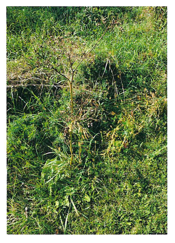
A dried out poison parsnip in the seeded area. (very hard to photograph)