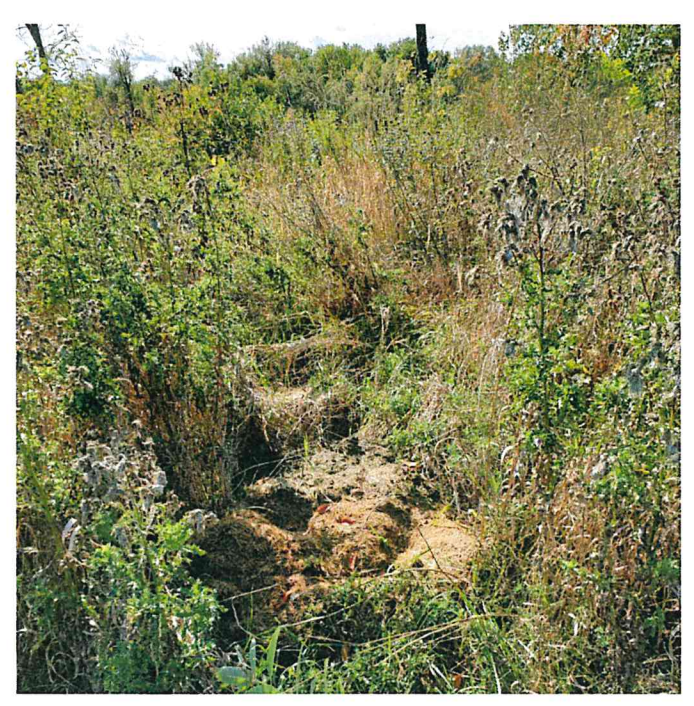
Dumping of grass clippings